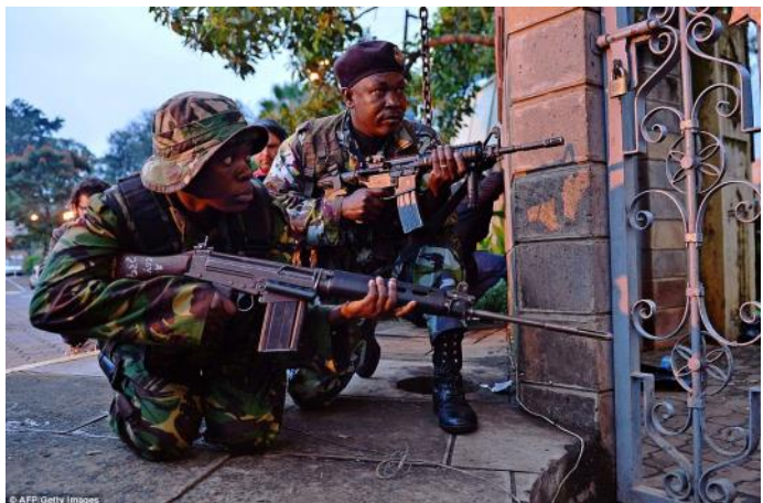
(U) Photo - Military forces staging outside the Westgate Mall.

At this point, more than 200 civilians have been rescued and 11 Kenyan soldiers have been wounded, the military said. (19) (20)