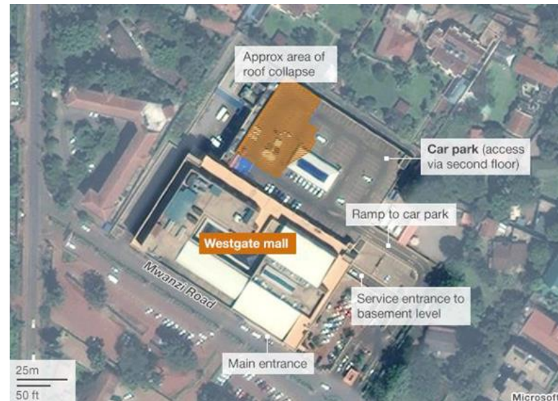
(U) Multi-story Nakumatt Supermarket and Department Store located under the rooftop parking garage (area of collapse) (26)

Note: Third floor and basement not shown (12)