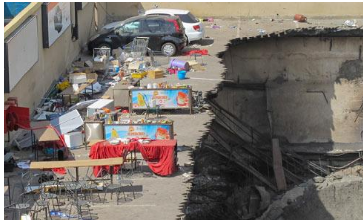
(U) Photo - Collapse of the parking deck through the Nukumatt Store.

The Westgate Mall attack was the deadliest terror attack in Kenya since Al Qaeda blew up the U.S. Embassy there in 1998, killing 213 people. Terrorism experts say this attack bears eerie similarities to the 2008 attack in Mumbai, India -- another upscale target with Western appeal. Lashkar-e-Taiba, a Pakistani terrorist group, attacked targets in Mumbai for more than three days, killing 166 people. (25)