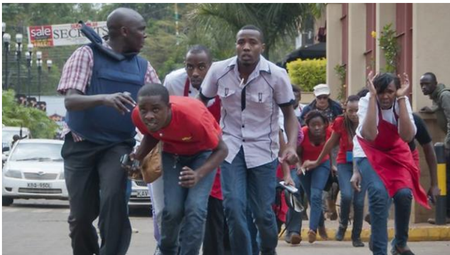
(U) Photo - Initial responders evacuate employees and shoppers from the Westgate Mall.