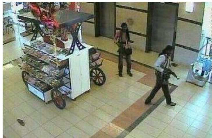
(U) Photo above– An image of two of the terrorists caught on closed circuit security cameras shortly after the beginning of the attack.