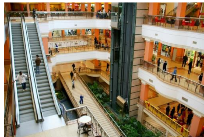
Central atrium of the Westgate Mall before the attack (11)