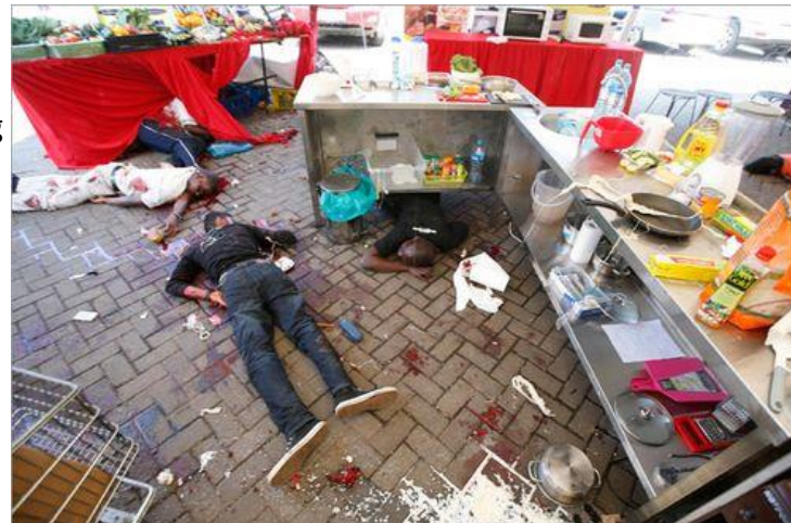
(U) Photo above- Aftermath of the attack at the cooking competition on the rooftop parking lot.

On more than one occasion, victims reported that the attackers asked cornered victims if they were Muslim's, asking questions such as the name of Mohammed's mother or demanding that they quote from the Koran. Witnesses report that terrorists allowed those who were Muslim to leave the mall, those who were not were shot. CCTV footage confirms these reports, showing instances of terrorists ushering people out of the mall and others where terrorists appear to question individuals and then execute them. (13) (14) (28)