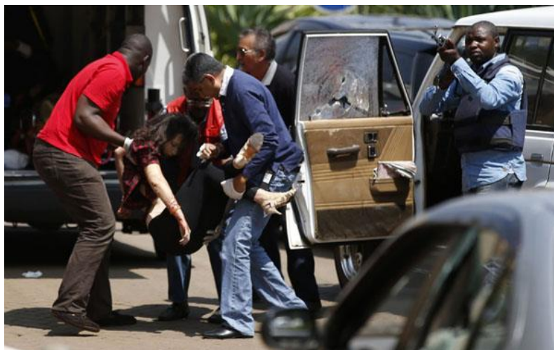
(U) PHOTO- A wounded woman is loaded into an ambulance outside the Westgate Mall in the early hours of the attack.

Early on September 22nd, a social media “Tweet” that allegedly came from Al Shabaab identified ten men, including three American citizens, that they identified as taking part in the attack at the Westgate Shopping Center. One of the individuals was reportedly from the Kansas City area. However, Al Shabaab “officials” later stated that the information provided and the social media account that sent the information were false. (12) (13) (20)