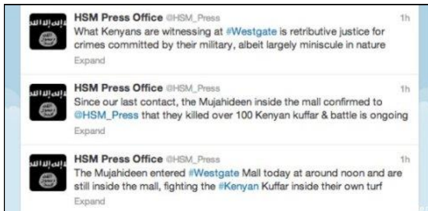
(U) Some of the Al Shabaab “Official” Twitter messages sent during the first day of the Westgate Attack. Al Shabaab continually sent messages during the attack claiming responsibility, praising the attackers and claiming more attacks are to come. (29)