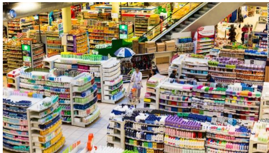
(U) PHOTO: Inside the Nukumatt Supermarket prior to the attack