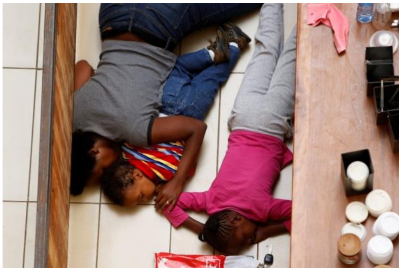
(U) PHOTO– A woman and children take cover during the attack.