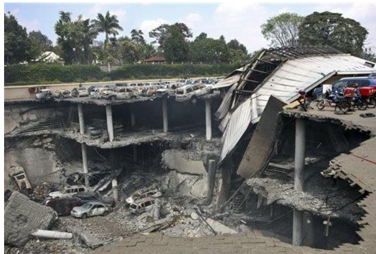
(U) Photo - Collapse of the parking deck through the Nukumatt Store.